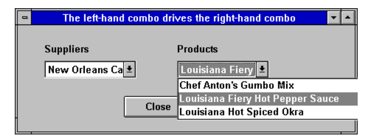
Figure 1 Paired combos. When the supplier combo is used, it calls the products' combo's Requery method to update the list.

Here's one solution—the form I built using it is shown in Figure 1 and included on the Companion Disk. In my example, the relationship is based on the Supplier and Product tables from VFP's sample TasTrade database. The left-hand combo shows suppliers. When you choose a supplier, the right-hand combo shows products available from that supplier.